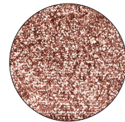
SHIMMER— Textured sparkle