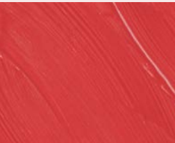
PLUMP YOU UP