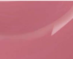
GLOSSY & BOSSY