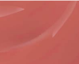
SECURE THE BAG