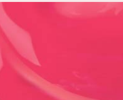
JUST A GIRL