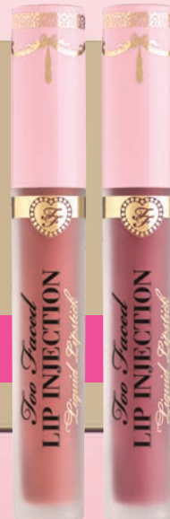
LIP INJECTION Power Plumping Lipstick