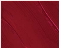
BOOM BOOM POW