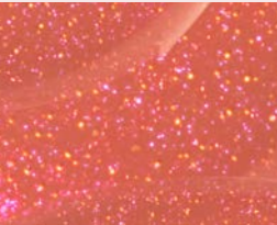
THE BIGGER THE HOOPS