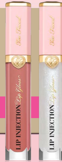
LIP INJECTION LIP GLOSS Power Plumping Lip Gloss