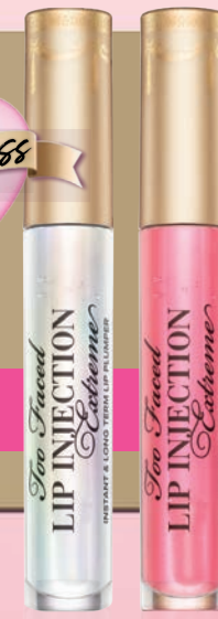
LIP INJECTION EXTREME Instant & Long Term Lip Plumper