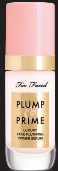
PLUMP & PRIME Luxury Face Plumping Primer Serum