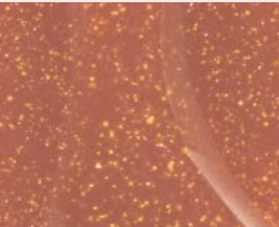
SAY MY NAME