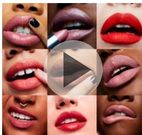
Perfect Red Lip Video