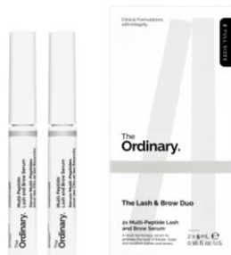
The Ordinary The Lash & Brow Duo