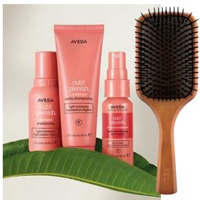
Aveda Healthy and Hydrated Hair Set