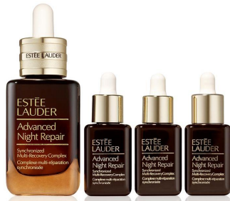
Estee Lauder ANR Hero Serum Set