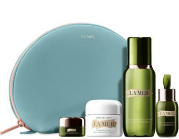
La Mer The Soothing Renewal Collection