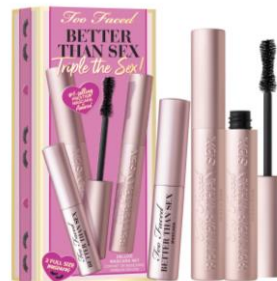
Too Faced Better Than Sex No Lash Left Behind