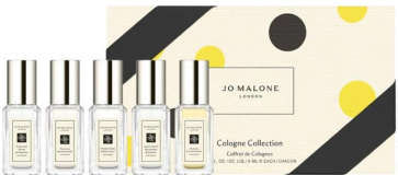
Jo Malone London Cologne Collection