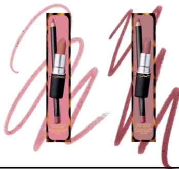
MAC Cosmetics Treasured Kiss Lip Duos (2 Shade Waves)