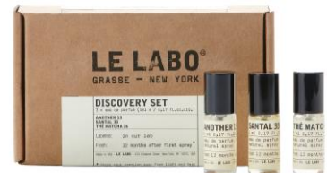
Le Labo Set