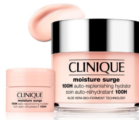
Clinique Twice the Moisture Moisture Surge Duo