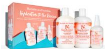
Bumble & bumble Hydration to the Rescue