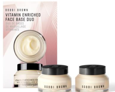
Bobbi Brown Vitamin Enriched Face Base Duo