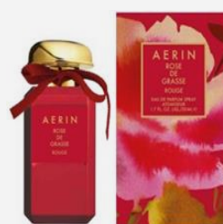
AERIN Rose de Grasse Rouge