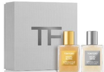
Tom Ford Beauty Soleil Mini Shimmering Body Oil Duo