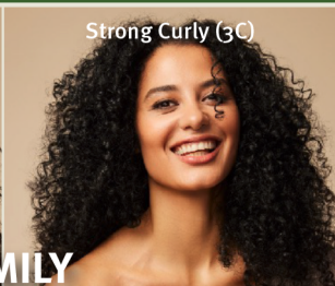
Strong Curly (3C)