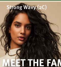
Strong Wavy (2C)