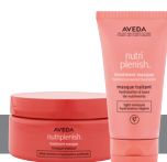
Nutriplenish™ Treatment Masque: Light Moisture (fine-to-medium) or Deep Moisture (medium-to-thick) 15 ml